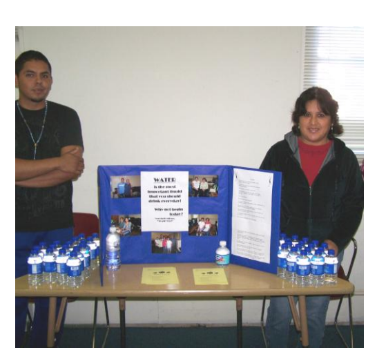
Water is the most important liquid that you should drink every day.

We also assigned display tables for information about diabetes, sugar, fiber, water, general nutrition, and for our various invited participants.