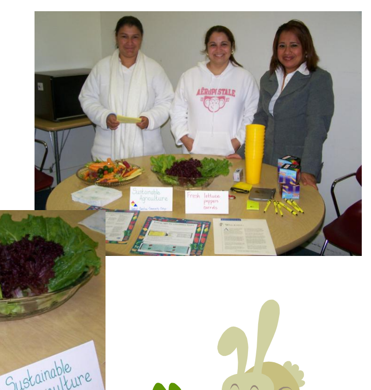
The Health Department supplied brochures about fitness and healthy nutrition

The Central Carolina Community College Sustainable Agriculture Department provided fresh vegetables.