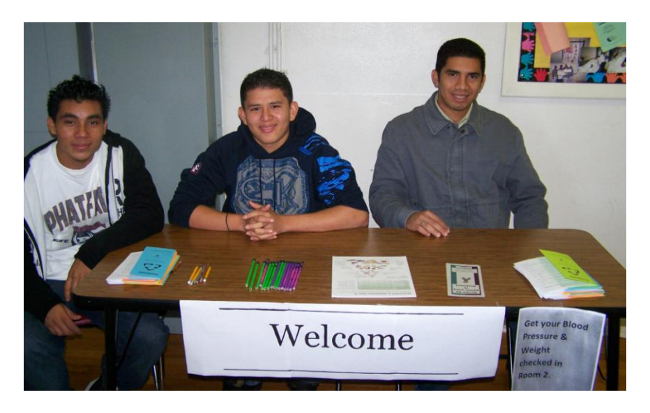
Get your blood pressure and weight checked in Room 2.

Tables were already in our break room area. We just rearranged them and set up two "welcome" tables at each end of the hall.